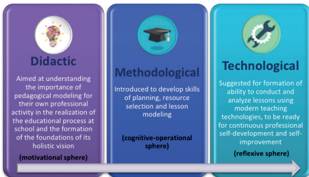
Figure 1. The goal specification of quasi-professional tasks system for training of future teachers for modelling and conducting lessons

By using such quasi-professional tasks, some important results were achieved: the majority of high-school students had a clear orientation towards pedagogical activity and a positive orientation towards the process of lesson modelling. Also, the important skills of performing mental operations (analysis, synthesis, prediction, generalization, reasoning, transfer of knowledge to new conditions) were recorded.