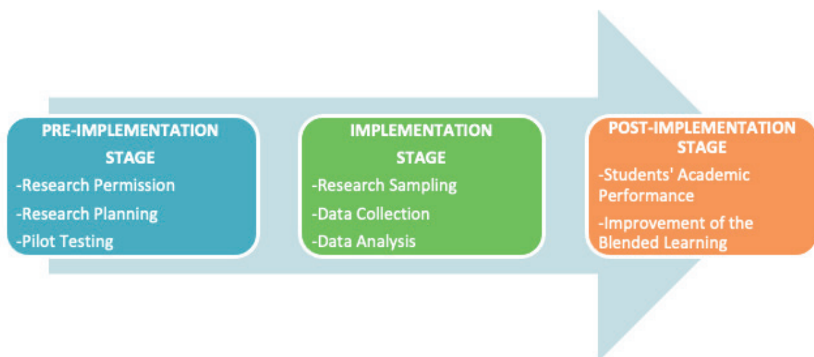
Figure 1. Implementation Process of the Study

A certificate from the graduate school, superintendents, and the school principals was secured before the conduct of the study to adhere to the safety and health protocols. Upon approval, researchers sent an invitation, an informed consent form that indicates voluntary participation and roles of the respondents, and a provision to withdraw from the study at any time. A research outline with a copy of the participant's rights and confidentiality protection was also attached to that form. All these were sent to the respondents via email and messenger. All these were given to the respondents. For confidentiality and anonymity, a code was assigned to each respondent. The hard copies of the data gathered from the respondents were kept in locked file cabinets, while the soft ones were stored in password-protected computers.