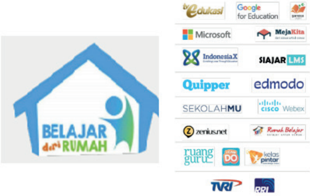
Figure 2. Online Learning Portals Officially in Partnerships with Indonesian Government