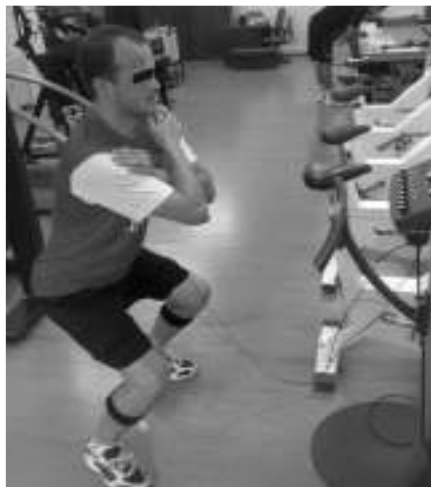
Fig.2. The 90° static squat LB-EMS position

Initially, anthropometric measurements were taken after 10min warm-up implemented with 5min unloaded pedaling a cycle ergometer and then 5min various stretching and jumping exercises, respectively. The strip electrodes (44x4cm for the thigh region and 27x4cm for calf region) were placed on the area of thigh and calf muscles during the 2 minutes rest period after the warm-up session. Then, 16s EMS application was applied bilaterally with an EMS application device (Miha Bodytec, Germany) at the maximal tolerated comfortably current intensity that specified in the trial and familiarisation period. The current was applied to 4s with 4s rest intervals with the specific current parameters that was described in the Table 2. None of the subjects reported any serious discomfort during EMS application. Each subject retained the 90° static squat-position (Figure 2.) throughout the LB-EMS application and rested in standing position during the rest intervals.