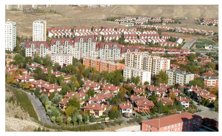
Figure 3: Modern neighbourhood.

from various sub-cultures has been so deep that it is impossible to be integrated in modern settlements different from the unity of traditional neighbourhoods. The homogenous structure of traditional culture replaced with the heterogeneous structure of modern culture (Koca and Karasozen [6]).