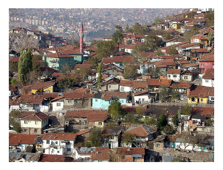
Figure 2: Squatter neighbourhood.

Beginning from the 1950s, migration from rural areas to cities started and caused deterioration on both physical and social environments, especially in big cities. The need for housing, which appeared as a consequence of dense immigration, led to an uncontrolled and unforeseen physical growth through the squatters of cities. This illegal growth has reflections from traditional texture of rural areas with their spontaneously developed irregular texture. As a negative result of their having legality and having permission for multi-storey buildings later on, some of these settlements which have a close location to the city centre have been transformed into low-quality apartment houses without physical and socio-cultural infrastructure (Koca and Karasozen [6]) (Figure 2).