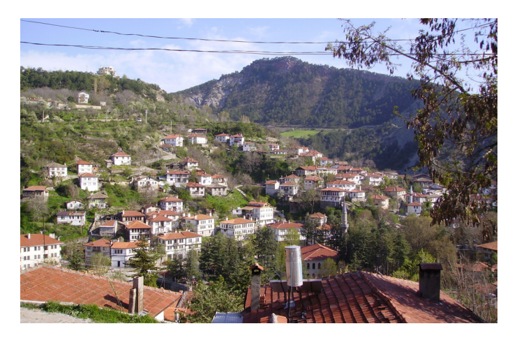
Figure 1: Traditional Turkish neighbourhood.

builders. On the other hand, the tissue of traditional Ottoman towns is affected from nomadic culture and devoid of rational order. The arrays of houses with spontaneously formed plans create narrow, irregular and picturesque road structures which lead to the centre and blind alleys as the extensions of main axes. There were no roads before the houses had been built and they were formed naturally and spontaneously. Although it hasn't got a rational worldview of an organized society, this tissue has been appeared by a functional and organic development (Kuban [4]) (Figure 1).