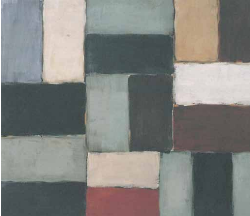
Painting 4. Wall of Light Aran, Oil on Canvas, 2002, Madrid, Nacional Centro de Arte Reina Sophia

popular culture as an example Scully's attempting to read the past getting at the deepness.