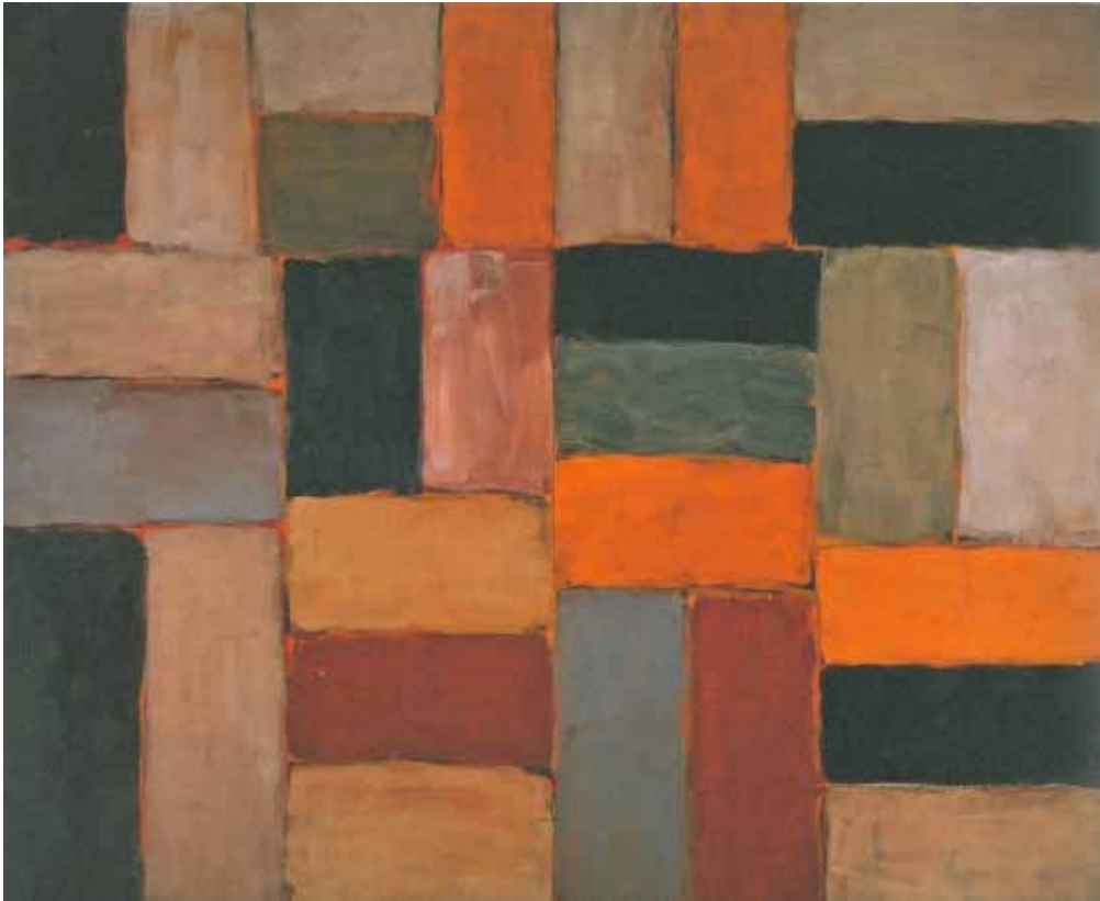
Painting 3. Wall of Light, Oil on Linen, 274.3x335.3 cm. 2003, Canberra, National Gallery of Australia

Robert Enright, who is one of the important contemporary painters in looking for the universal rhythm of the objects and in catching the lofty sentimentality with believe in converting his painting to an exceeding personal outlook, describes as a painter like a 'street fighter' to Scully's being decided about tenacious and a hard beauty understanding. And he thinks that his paintings have a monumental feature like Motherwell's, Barnett Newman's and Brice Marden's works. Enright expresses that Scully spends his all life to 'make his brush stroke personalize' insofar as possible. As a result he attracts attention that there are very clear clues about his personal expression in the rude geometric form which are in his paintings. Essentially in his paintings "Nothing is abstract: He is his portrait, the portrait of conditions of a person". He accepts his