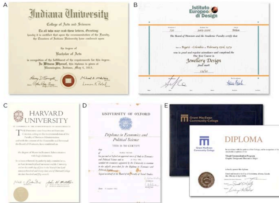
Visual 4. Left: Various diploma designs of some institutions.

A diploma represents a university's history, its roots, its prestige and its vision. It is the most valuable document a university distributes. While representing the corporate identity of the university, diplomas also carry the responsibility of hosting a university's respectability and value in one single surface.