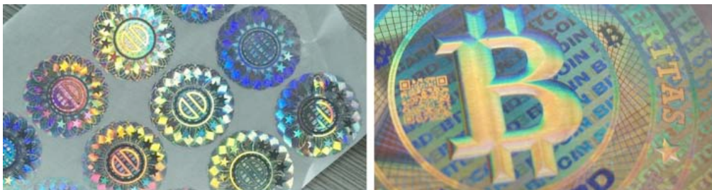
Visual 1. Examples for OVD's. Left: Ready made hologram stickers found for online purchase threaten the liability of hologram technique. Right: Hologram design for bitcoin card. (Source: https://minrui.en.alibaba.com , http://i.imgur.com/J0XYaVM.jpg?1 )

OVD's can vary in size and shape, as well as the design of the interior image, they can also have various effects such as relief, mini texts, colored areas, matt areas, black or gold areas. The designer works in a vector format software to produce these images.