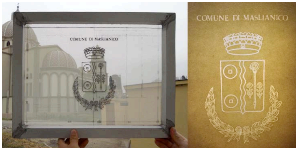
Visual 3. Left: The moulded mesh used to produce the paper with the watermark. Right: The watermark can be observed when paper is looked at in front of a light source.

g. Filigrees (Watermark): A security feature that is based on the paper substrate, filigrees are images or type that appear when the paper is looked at in front of a light source. Filigrees are produced in the paper production stage where special moulds are applied to the paper pulp. Some paper companies offer ready made design of filigrees and it is also possible to produce a special filigree for a specific institution. The design of this filigree should also be conducted by the graphic designer of the diploma.