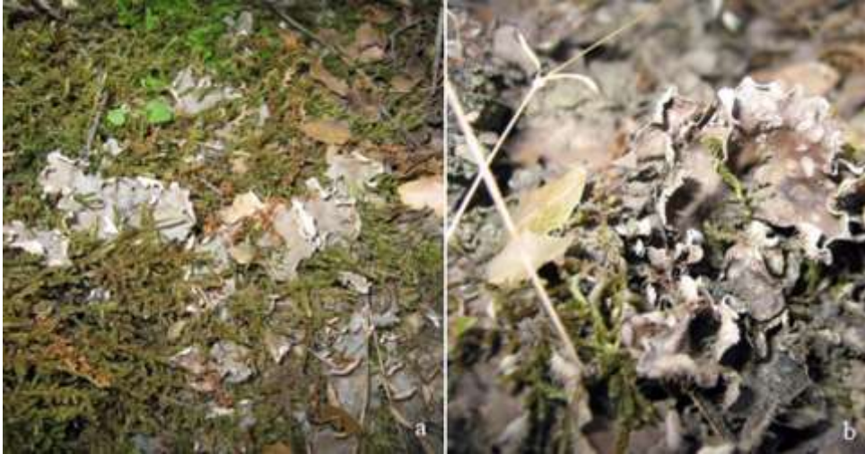
Figure 2. Peltigera extenuata a. habitus, b. Soralia (ANES:15585)