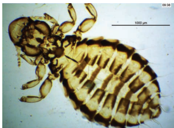
Figure 3. Cuclotogaster heterogarpus , female, original.