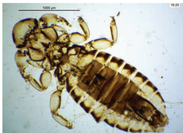
Figure 4. Cuclotogaster heterogarpus , male, original.

the Eurasian Woodcock, P. silvicultrix from the Common Redstart ( Phoenicurus phoenicurus ), P. longiceps from the Cetti's Warbler ( Cettia cetti ), B. iliaci from the Redwing, P. pikulai from the Barred Warbler ( Sylvia nisoria ), Brueelia sp. (N) and Penenirmus sp. (N) from the Black-headed Bunting, and C. latifrons from the Common Cuckoo ( Cuculus canorus ) are reported for the first time in Turkey. The Common Moorhen ( Gallinula chloropus ), Macqueen's Bustard ( Chlamydotis macqueniei ), Eurasian Woodcock, Redwing ( Turdus iliacus ), and Tawny Owl ( Strix aluco ) were examined for lice for the first time in Turkey in this study. The Eurasian Woodcock had 2 louse species and Redwing had 1 louse species, while the others had no louse infestation. These lice are therefore new records for Turkey. Thus, C. heterogarpus was determined for the first time anywhere in the world on turkeys.