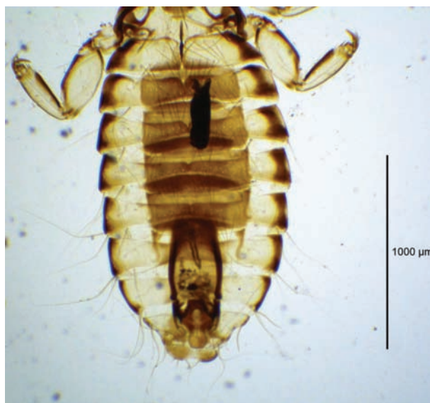
Figure 5. Cuclotogaster heterogarpus , male genitalia, original.

In conclusion, 25 lice species were recorded on birds in this study. R. helvolus and Saemundssonina sp. (N) from