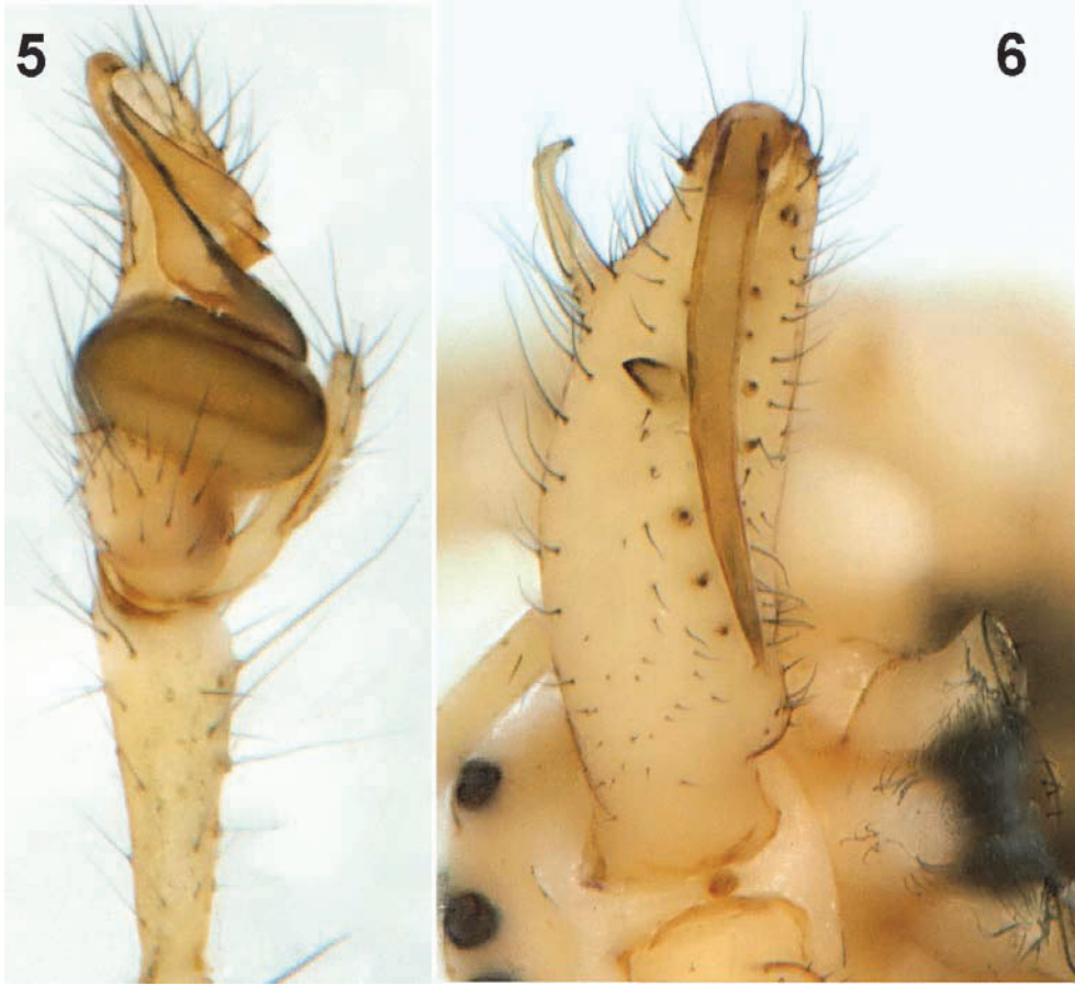
Figures 5-6. Male of Tetragnatha pinicola from Turkey 5 – left palp, ventral; 6 – left chelicera, ventral.