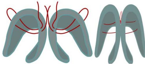
Fig. 3. (a); (b) The narrowing effect of the dome suture at a lower localization

Task III: When the dome-binding suture is placed 3 or 4 mm lower than the highest point of the tip, the tip looks slightly wider but more natural, and the rest of the cartilage becomes closer.