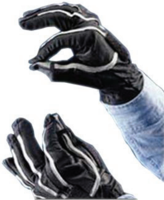
Pinch Gloves (Inition, 2011)

A pinching gesture can be used to grab a virtual object, and provides a reliable and low-cost method of recognizing natural gestures.