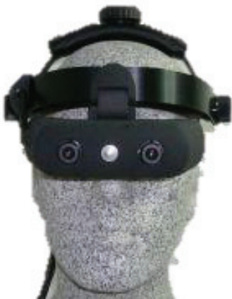
Video-see through system (Trivisio, 2011)

Head-mounted device is a kind of display which worn on the head or as part of a helmet. It has that has a small display optic in front of one or each eye.