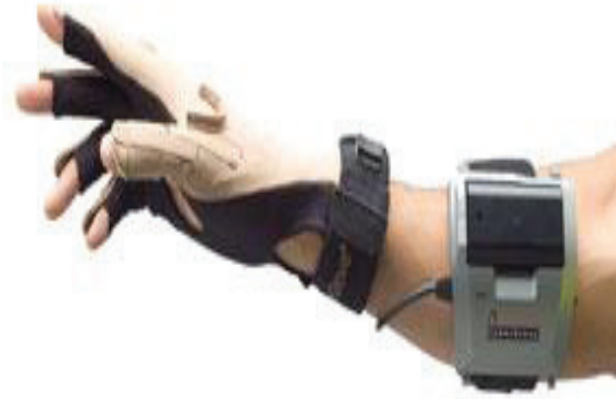
Data Glove (CyberGloves, 2011)