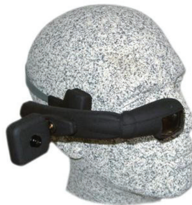
Optic-see through system (Inition, 2011)