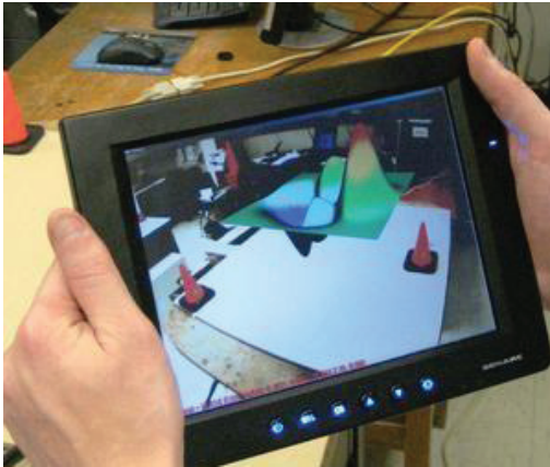
A handheld AR system displaying a three dimensional graph registered to the cones and table (CSM, 2011)

Small computing devices with a display that the user can hold in their hands.